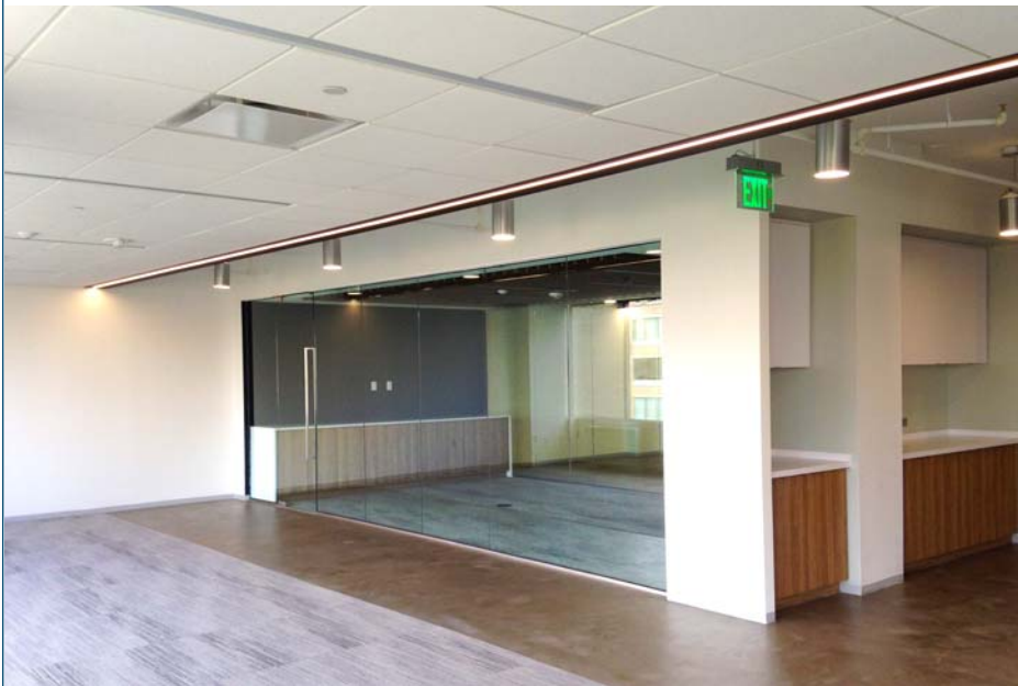
OPEN OFFICE TO BACK OF CONFERENCE AND COPY/PRINT AREA